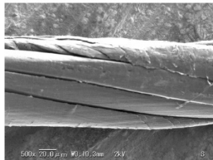
(b) Ethanol Treatment